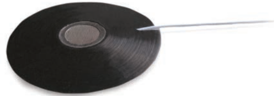
Model 130B40 Low Profile Surface Microphone Pad